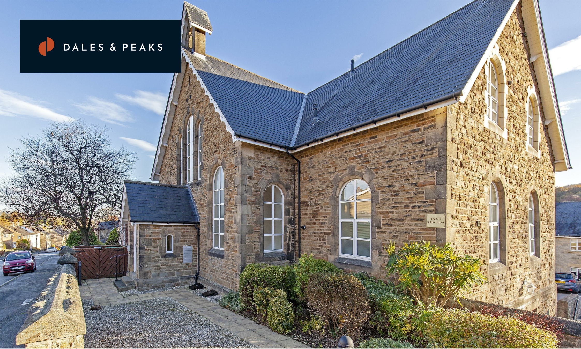
The Old School House Holymoorside, S42 7DJ £800 PCM