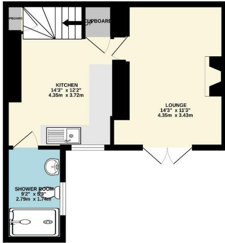
GROUND FLOOR 338 sq.ft. (31.4 sq.m.) approx.