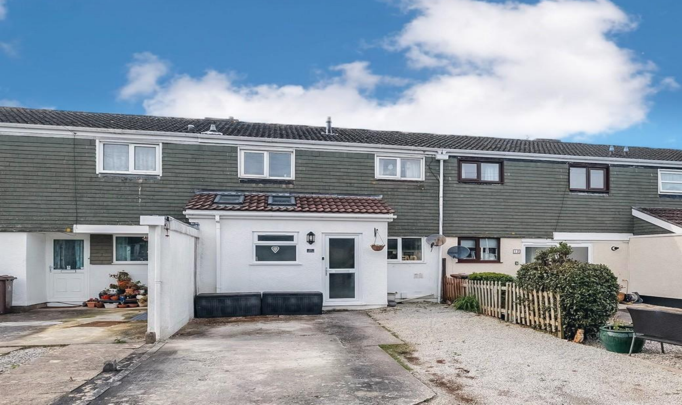
14 Ronsdale Close, Plymstock, Plymouth, PL9 7QZ