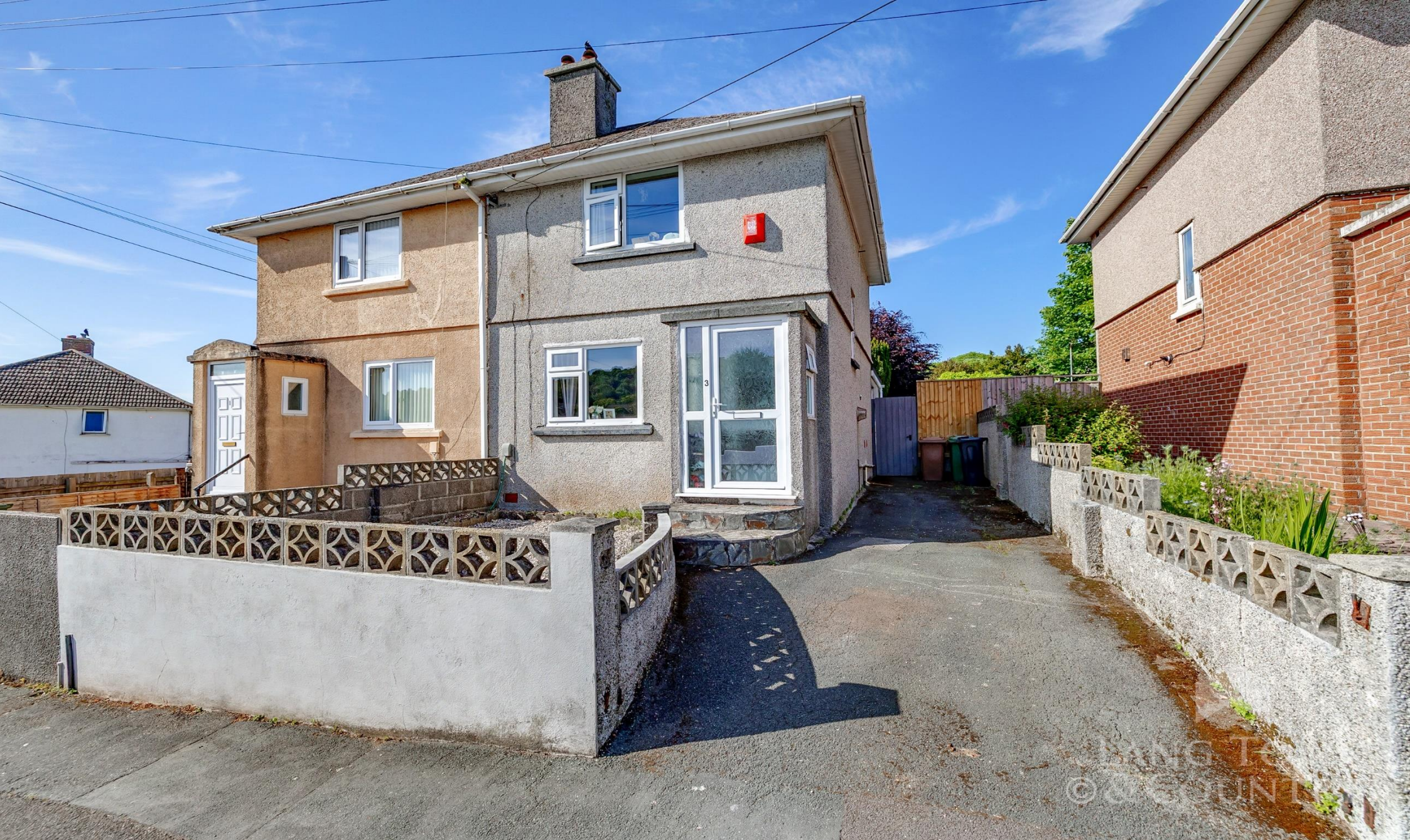
3 Meadow Park, Hooe, Plymouth, Devon, PL9 9NU