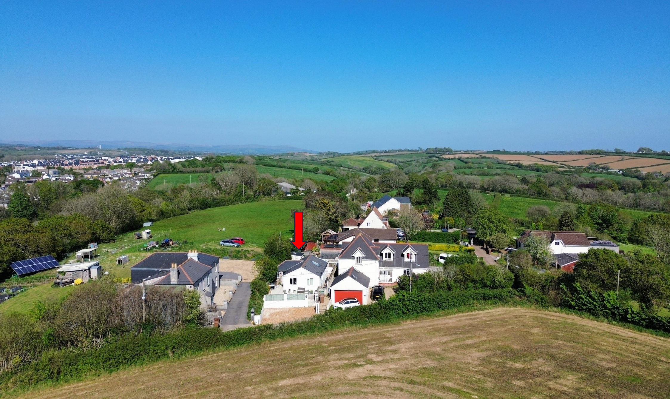
The Jays, Arcadia, Elburton, Plymouth, Devon, PL9 8EF