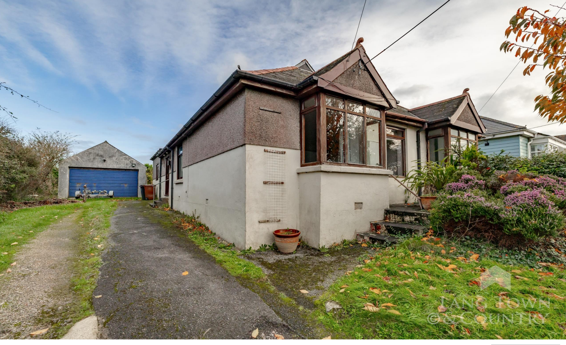
49 Church Road, Wembury, Plymouth, Devon, PL9 0JF