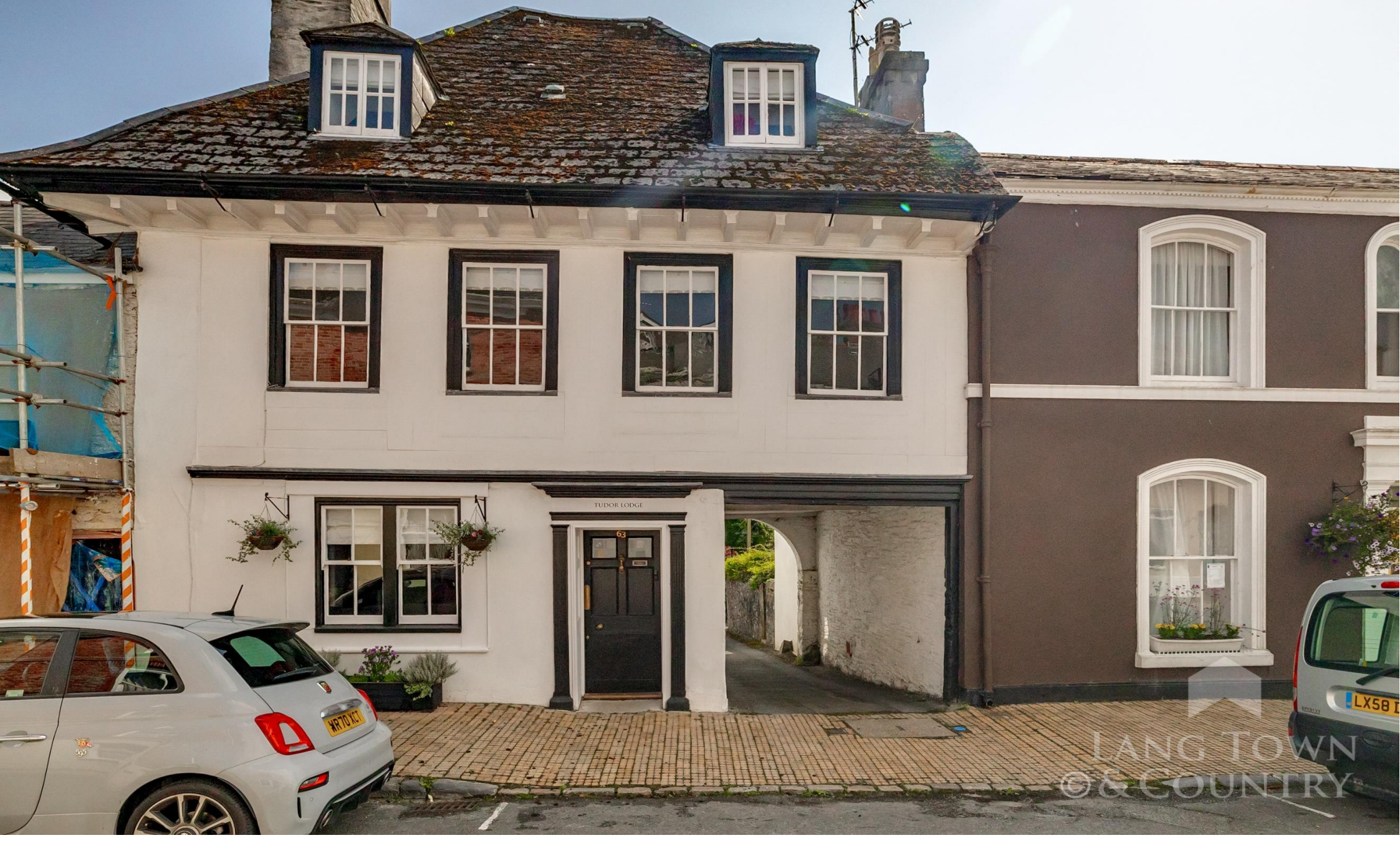
Tudor Lodge, 63 Fore Street, Plympton, Plymouth, Devon, PL7 1NA