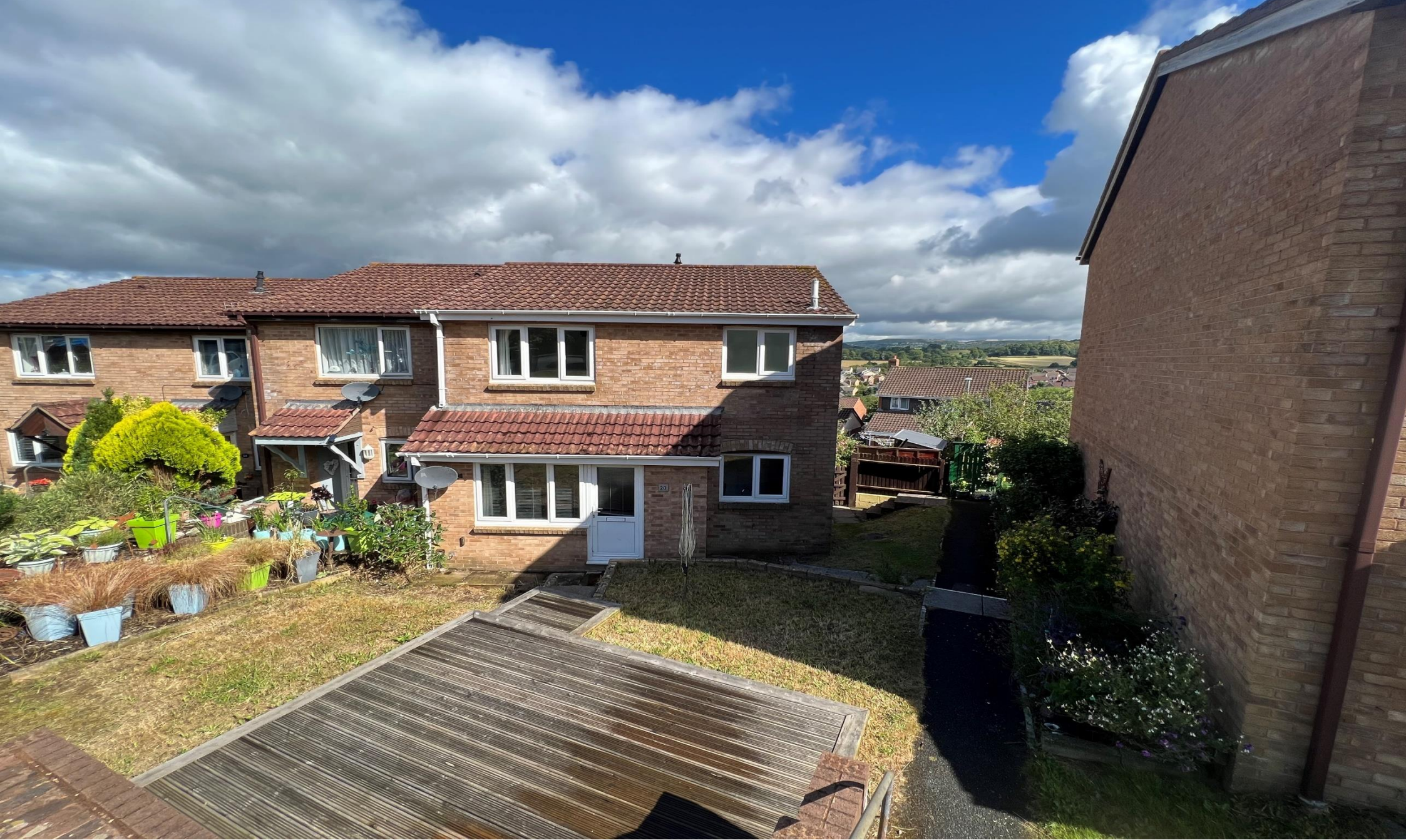
20 Liddle Way, Chaddlewood, Plymouth, Devon, PL7 2WZ