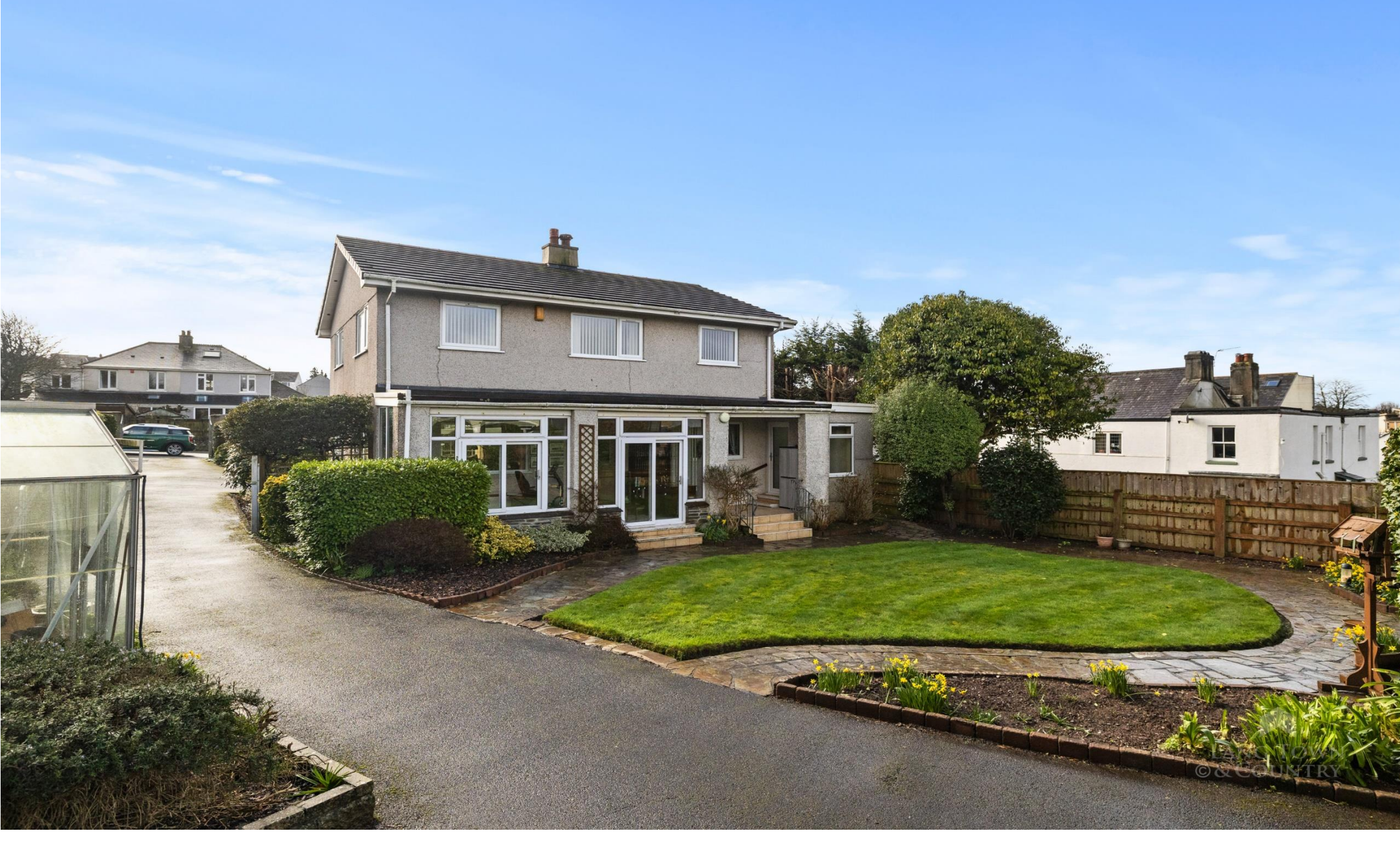
5 Stanborough Road, Plymstock, Plymouth, Devon, PL9 8SP