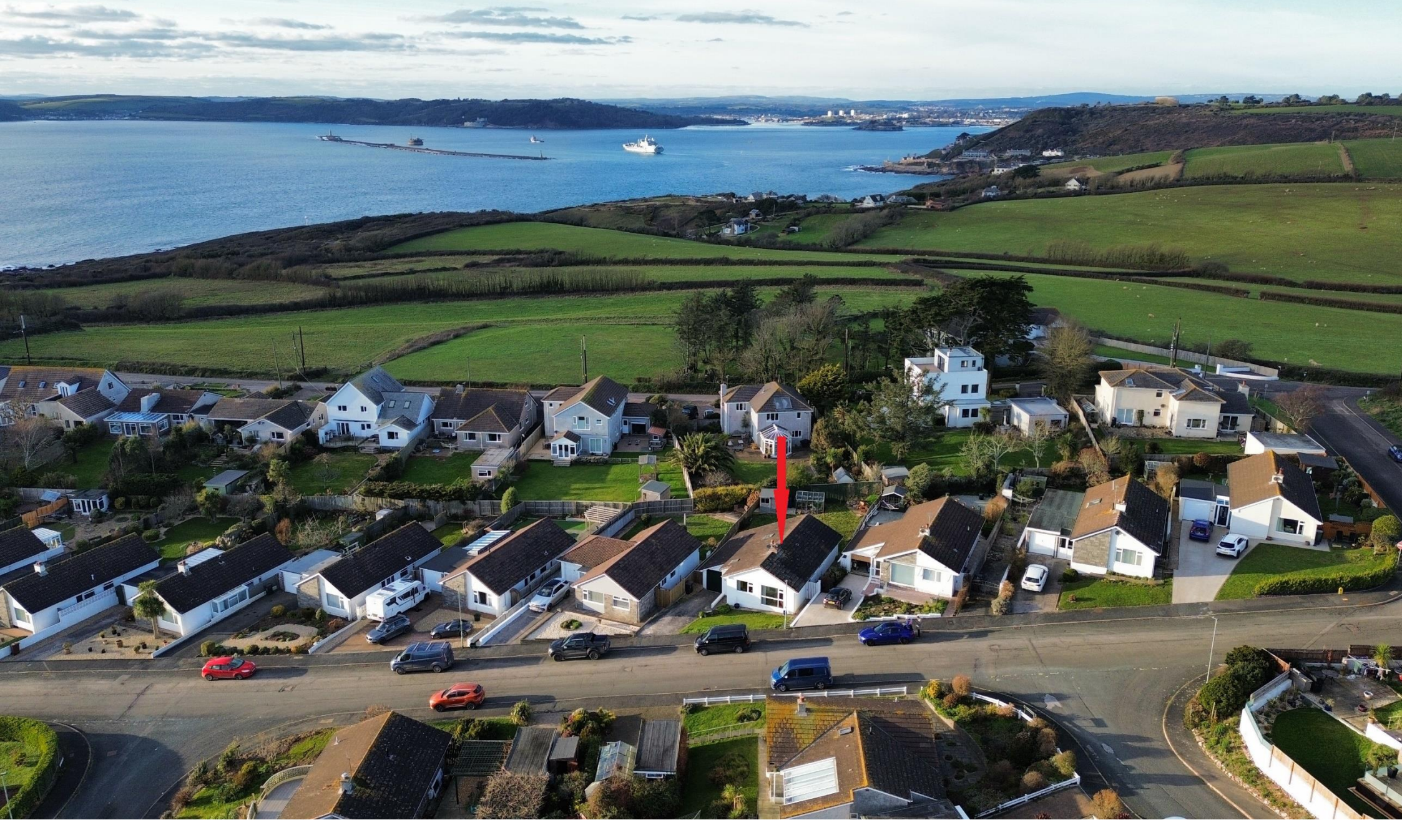
8 Westlake Rise, Heybrook Bay, Plymouth, Devon, PL9 0DS