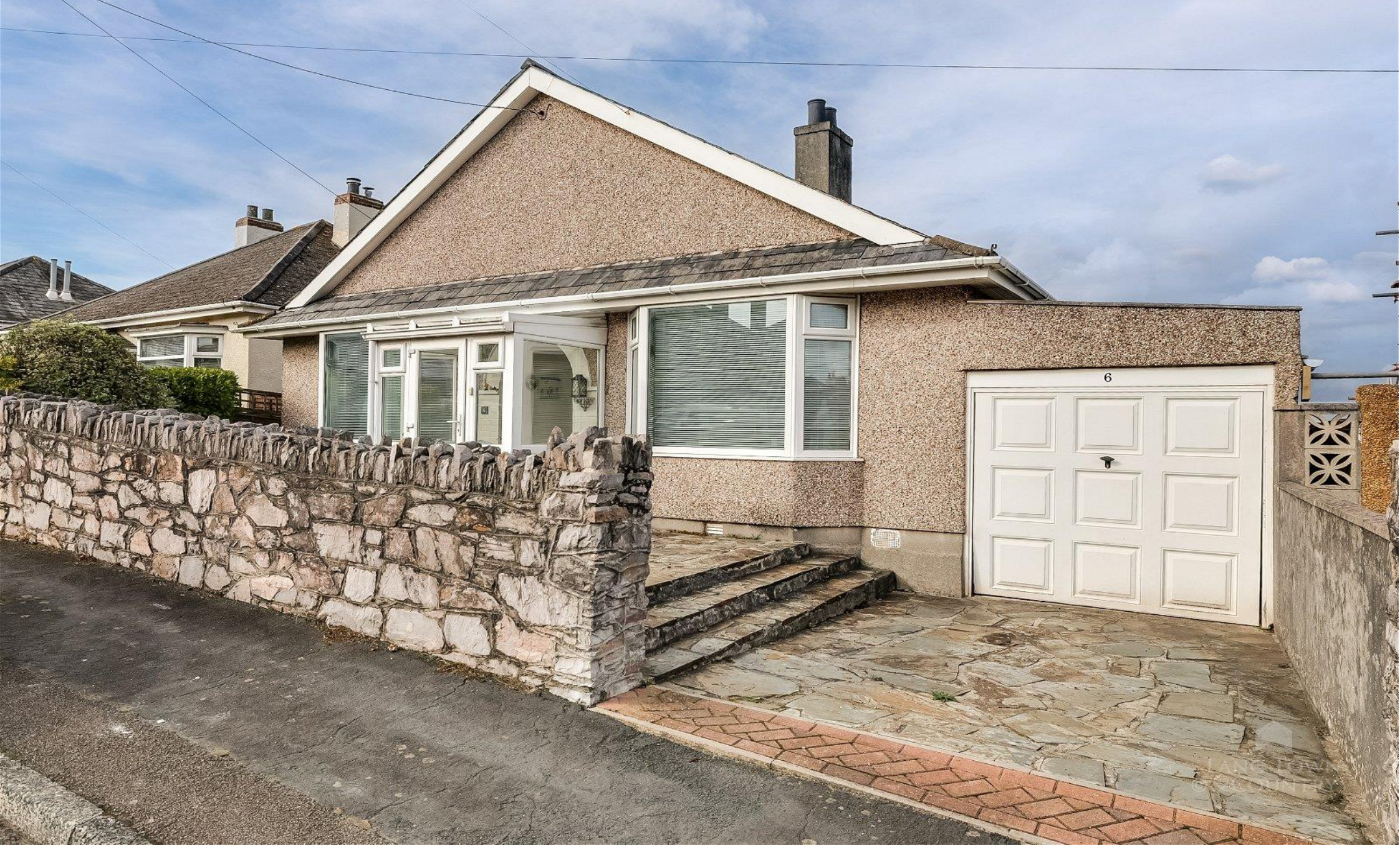
6 Underlane, Plymstock, Plymouth, Devon, PL9 9JX