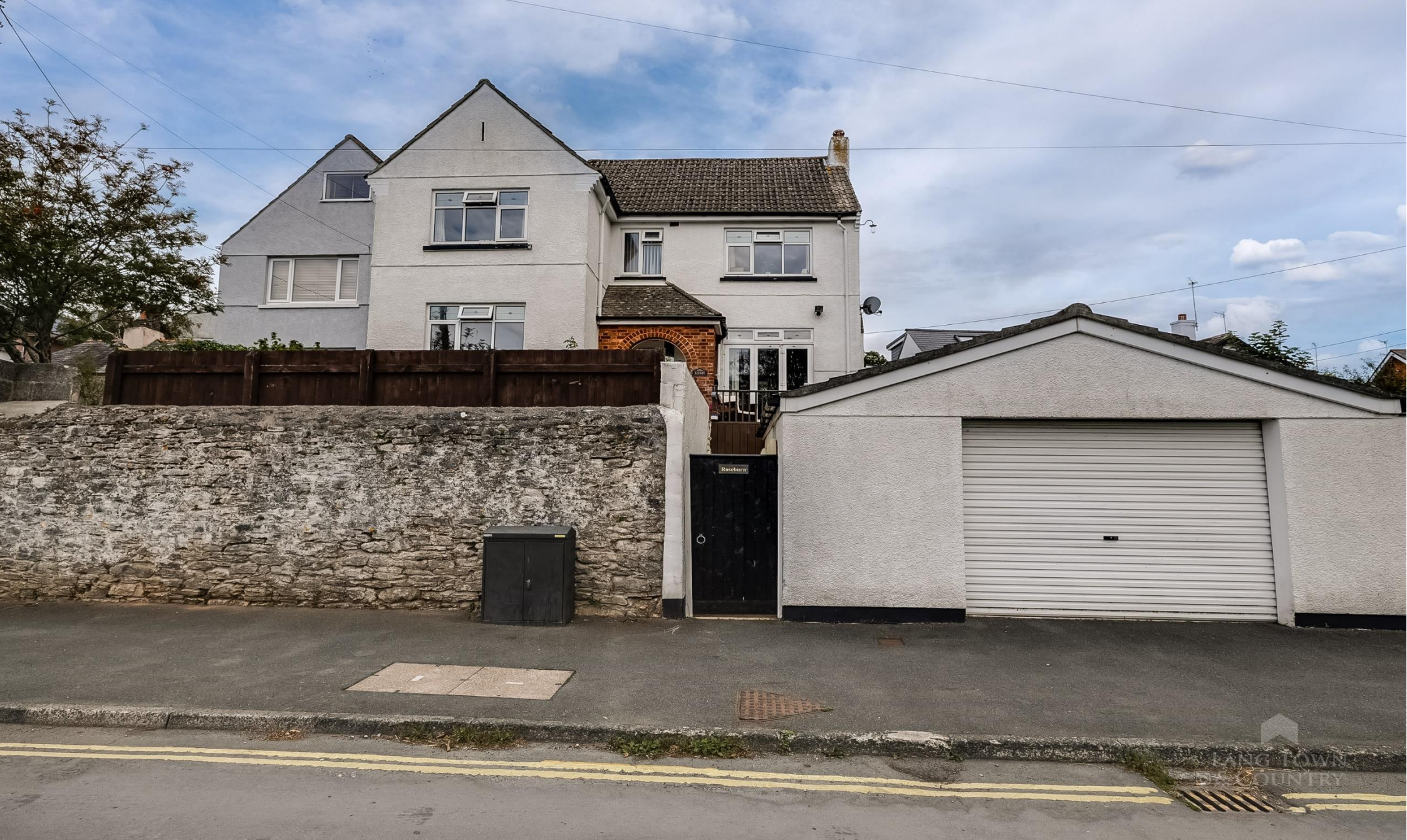
Roseburn, Lake Road, Hooe, Plymouth, Devon, PL9 9RA