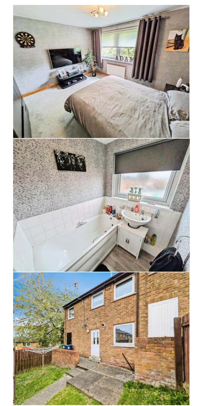
EPC WILL GO HERE

Important Note: Rook Matthews Sayer (RMS) for themselves and for the vendors or lessors of this property, whose agents they are, give notice that these particulars are produced in good faith, are set out as a general guide only and do not constitute part or all of an offer or contract. The measurements indicated are supplied for guidance only and as such must be considered incorrect. Potential buyers are advised to recheck the measurements before committing to any expense. RMS has not tested any apparatus, equipment, fixtures, fittings or services and it is the buyer's interests to check the working condition of any appliances. RMS has not sought to verify the legal title of the property and the buyers must obtain verification from their solicitor. No persons in the employment of RMS has any authority to make or give any representation or warranty whatever is relative to this property.