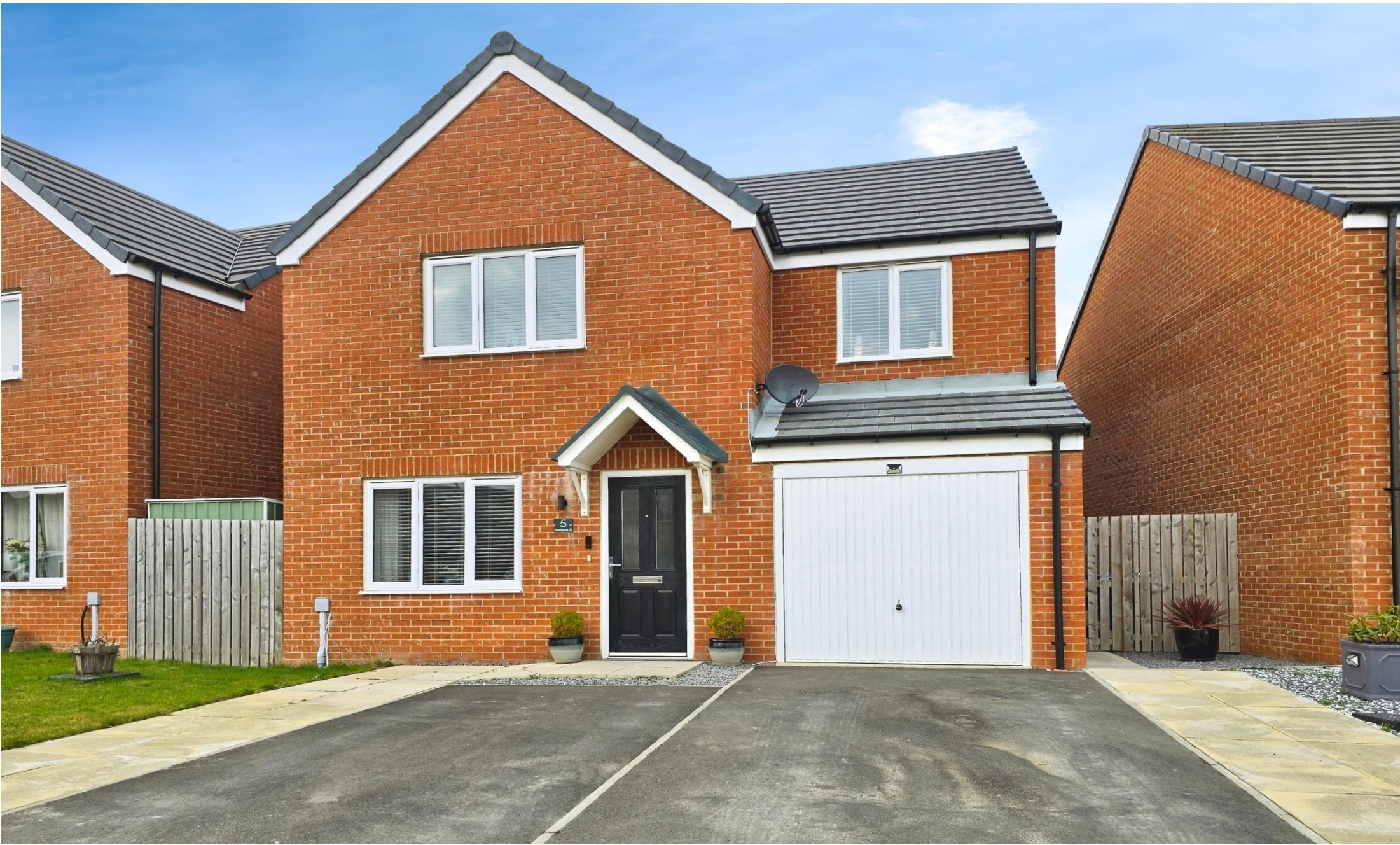
Strathtyrum Drive Cramlington