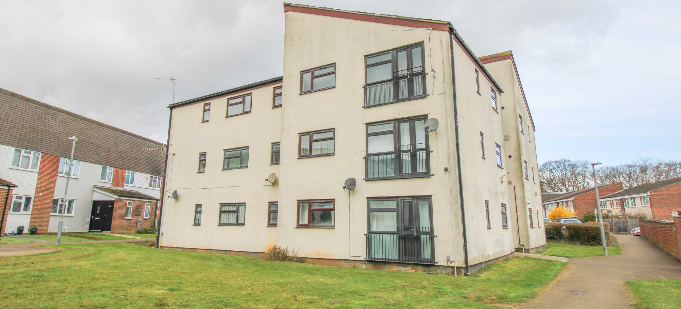
Little Cattins, Harlow, CM19 5RN Guide Price £190,000