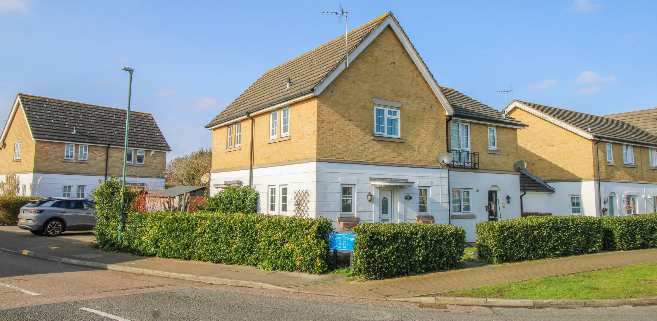
Hadley Grange, Church Langley, CM17 9PQ Guide Price £260,000