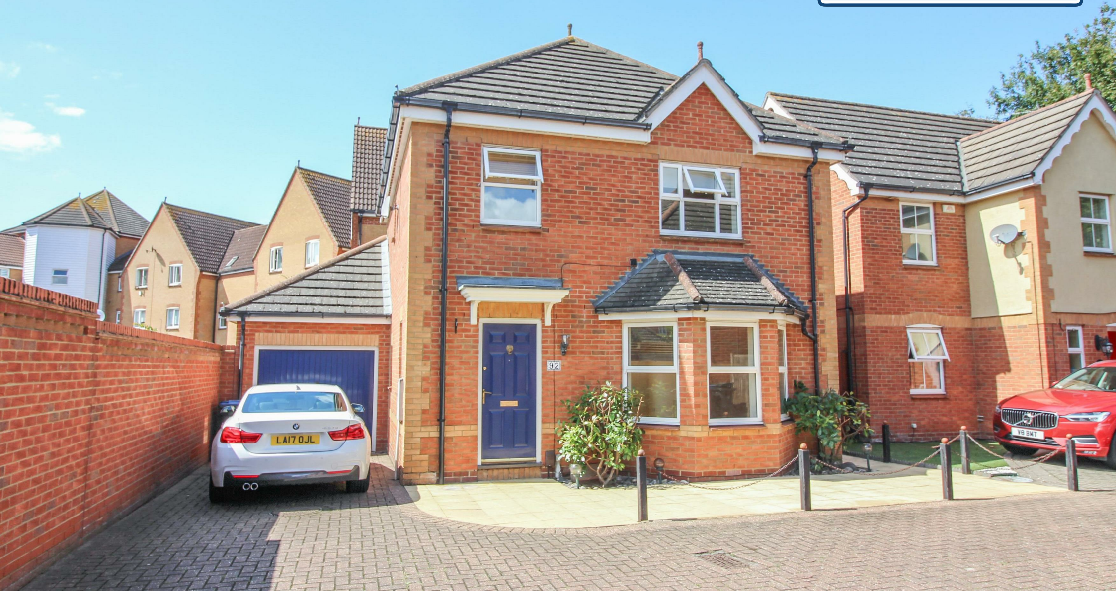
Chelsea Gardens, Church Langley, CM17 9RY Guide Price £450,000