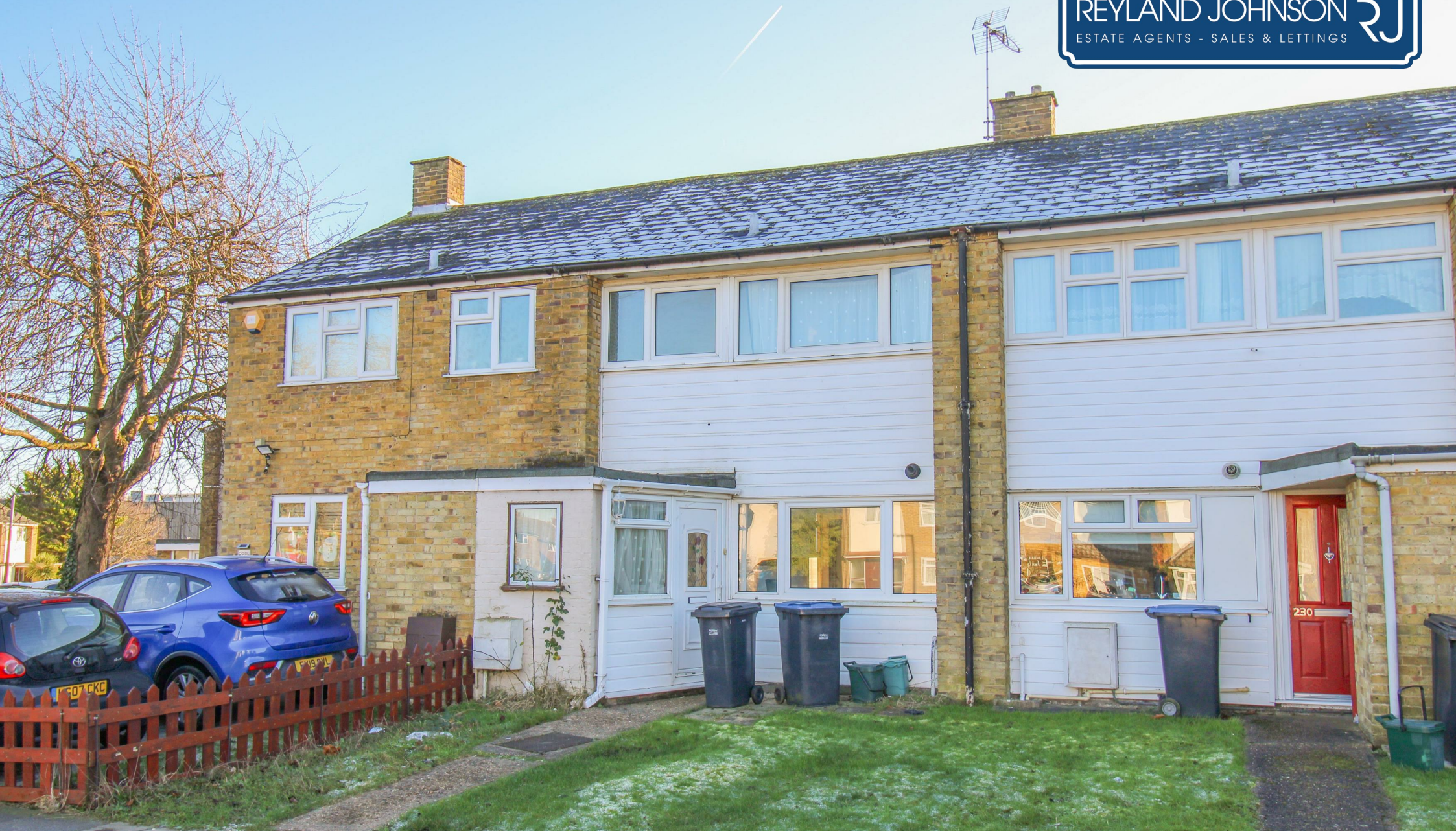
Spencers Croft, Harlow, CM18 6JN Guide Price £280,000