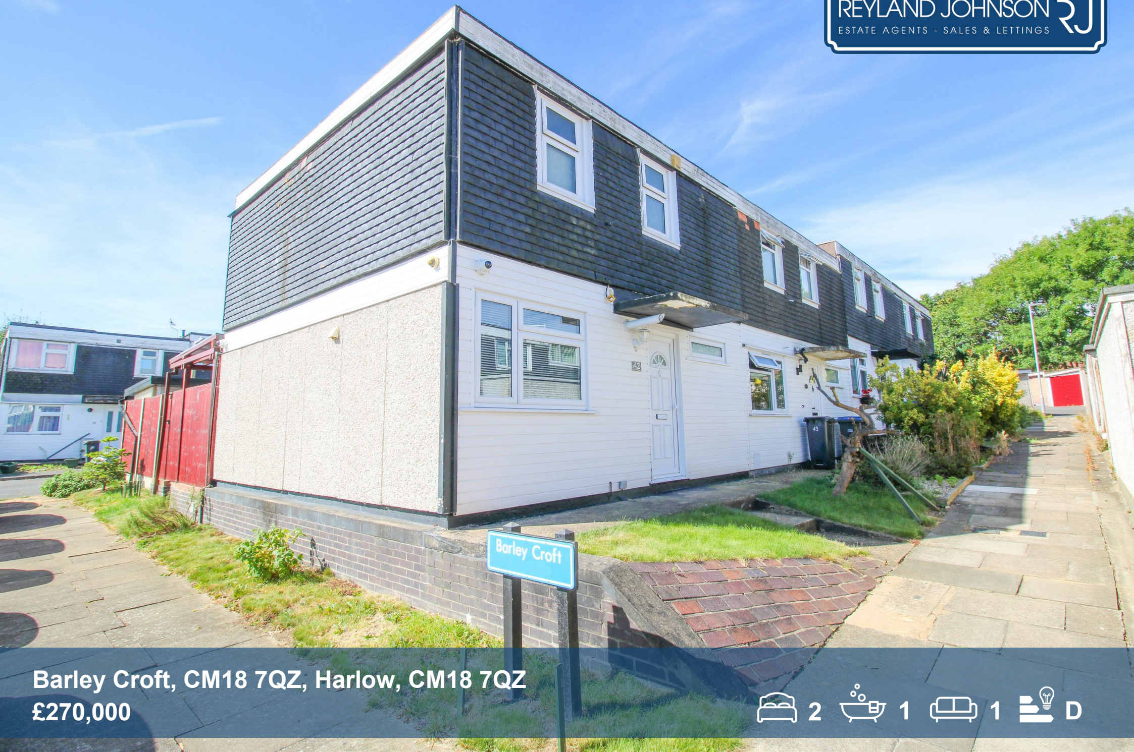
Barley Croft, CM18 7QZ, Harlow, CM18 7QZ £270,000