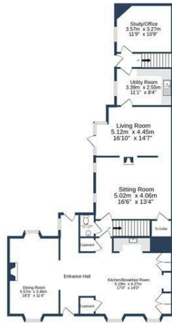
GROUND FLOOR 258.3 sq.m. (2781 sq.ft.) approx.