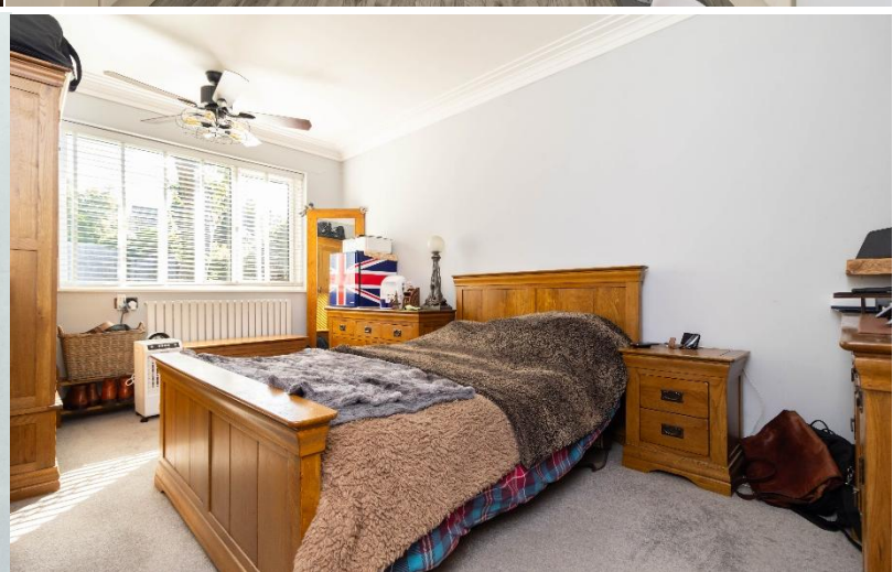
FLAT 6 HAZEL COURT, BOND ROAD, WARLINGHAM SURREY. CR6 9SD