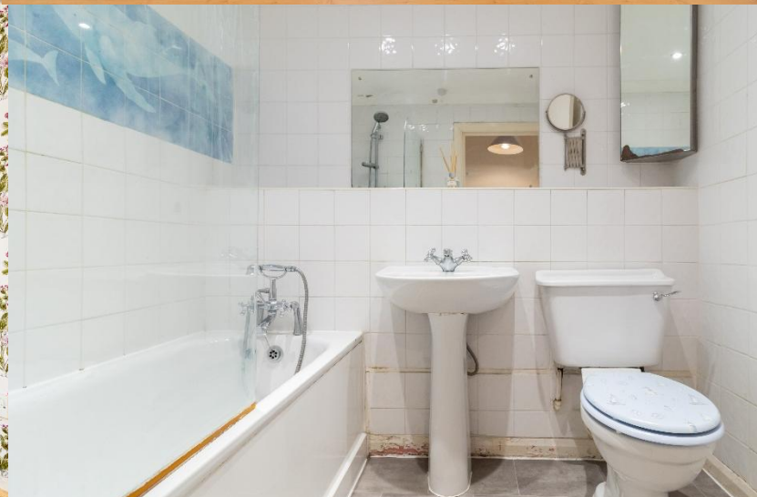
FLAT 8 ARCHERS COURT, 13A NOTTINGHAM ROAD, SOUTH CROYDON, CR2 6LN