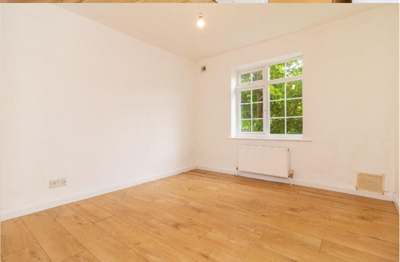
GORDON COURT, ST JOHNS TERRACE ROAD REDHILL, SURREY, RH1 6HU