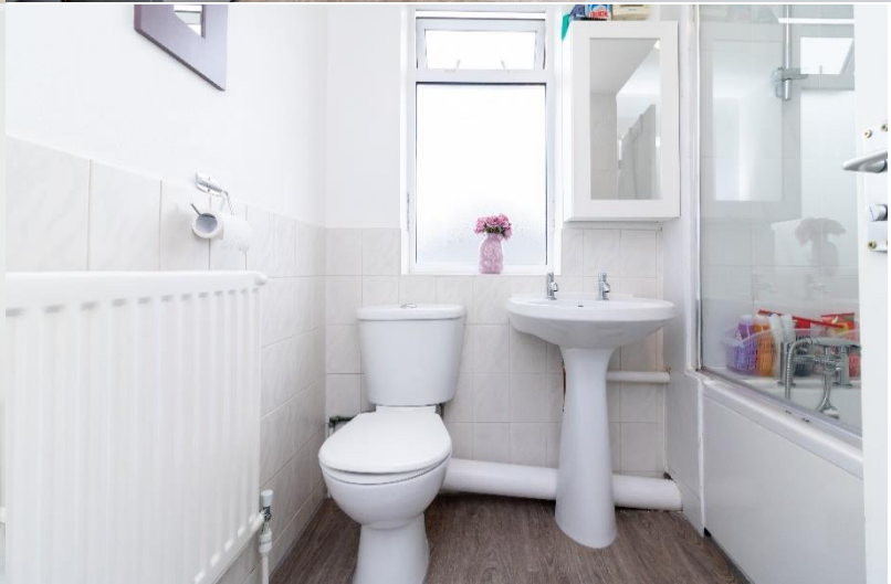
KINGS COURT, BEDDINGTON GARDENS WALLINGTON, SURREY, SM6 0HR