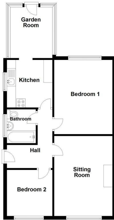
Total area: approx. 60.9 sq. metres (655.0 sq. feet)