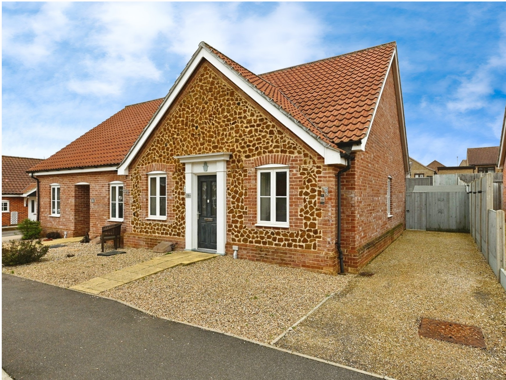
Butterfield Rise, Hunstanton, PE36 5PU