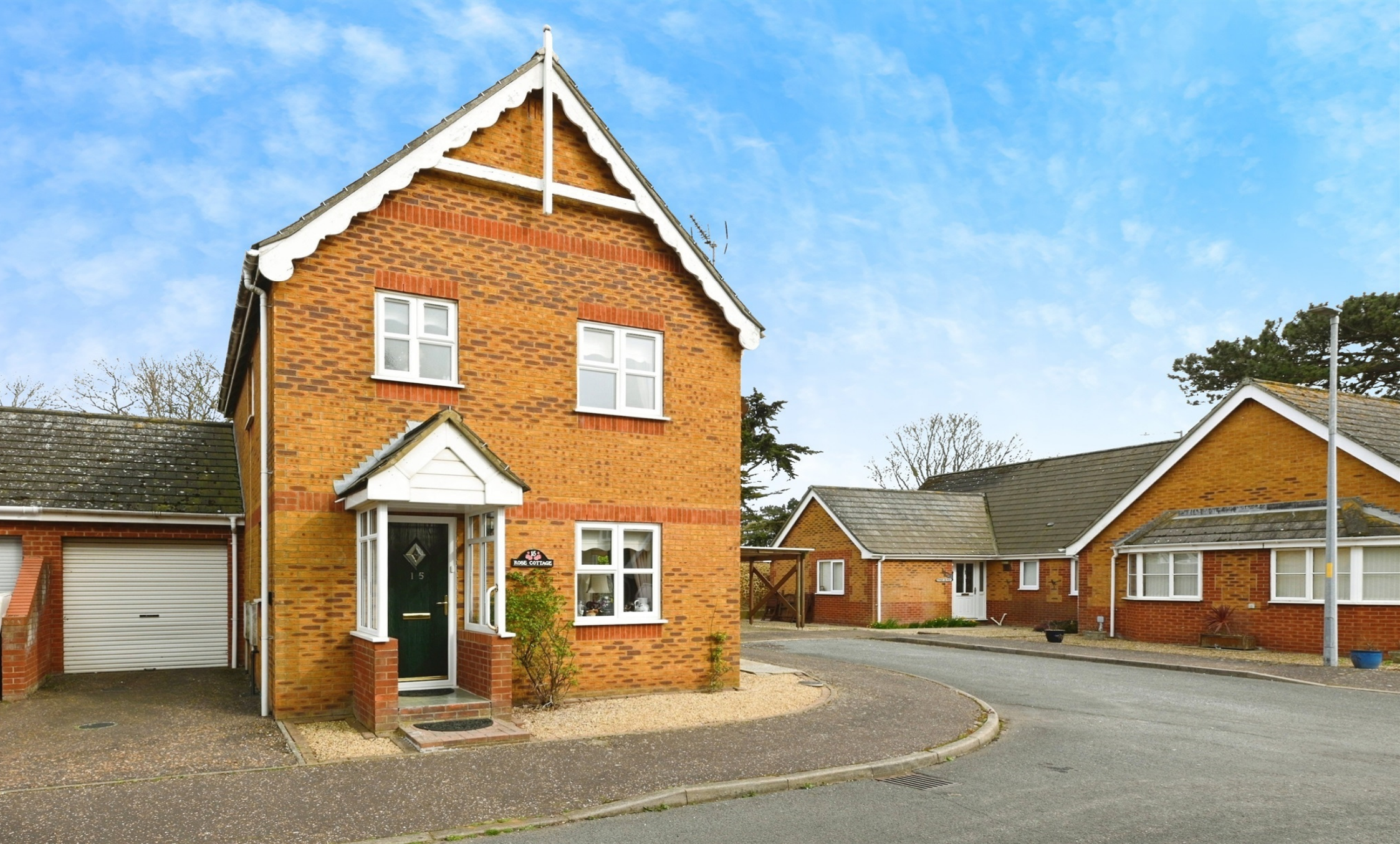
Valentine Court, Valentine Road, Hunstanton, PE36 5NP