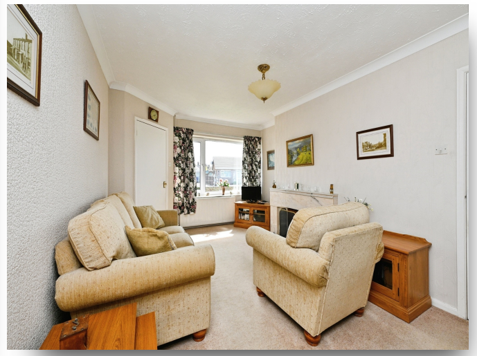
South Moor Drive, Heacham, King's Lynn, PE31 7BW