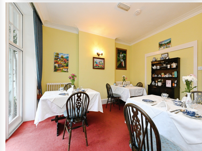
Boston Square, Hunstanton, PE36 6DT