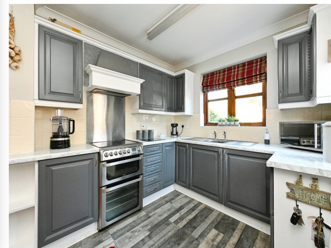
Manor Road, Dersingham, KING'S LYNN, PE31 6LN