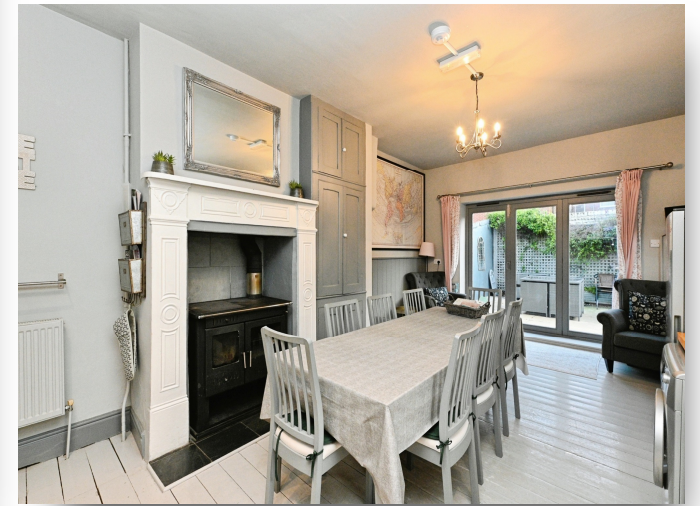
Victoria Avenue, Hunstanton, PE36 6BX