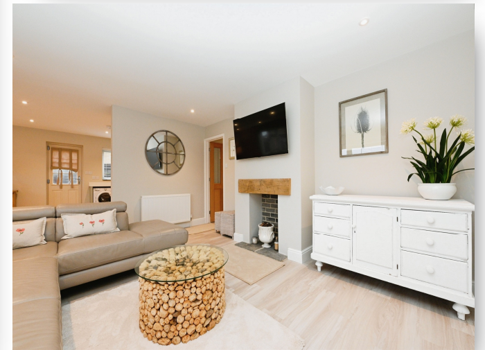
Linn Chilvers Drive, Heacham, King's Lynn, PE31 7SW