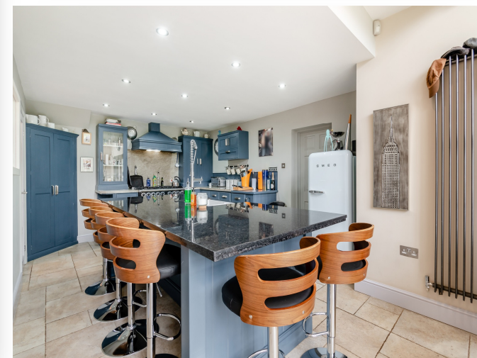
School Road, Heacham, King's Lynn, PE31 7DE