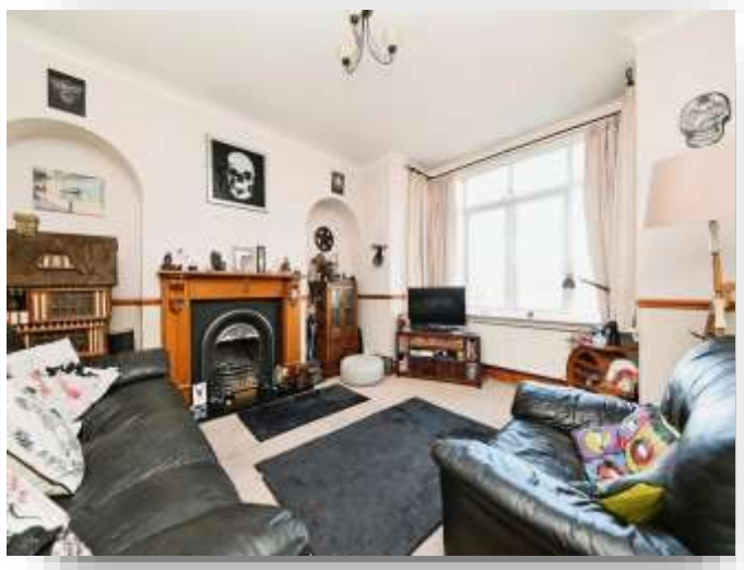
Chapel Lane, Hunstanton, PE36 5AN