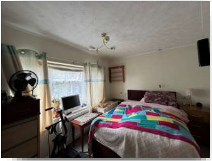
Orchard Park Homes, Station Road, Heacham, Lynn PE31 7HF