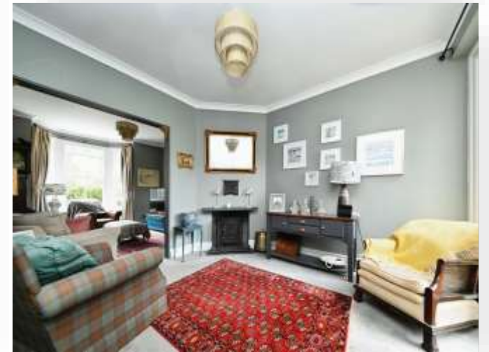
Glebe Avenue, Hunstanton, PE36 6BS