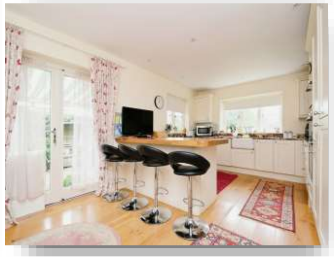
High Street, Docking, King's Lynn, PE31 8NH