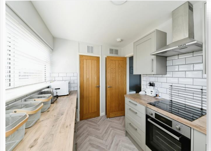
Clarence Court, Hunstanton, PE36 6EB