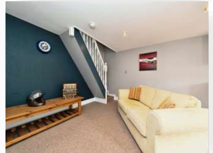
Westgate, Hunstanton, PE36 5AL