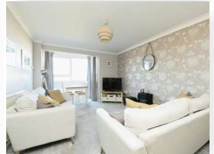
Buckingham Court, Hunstanton, PE36 6DA