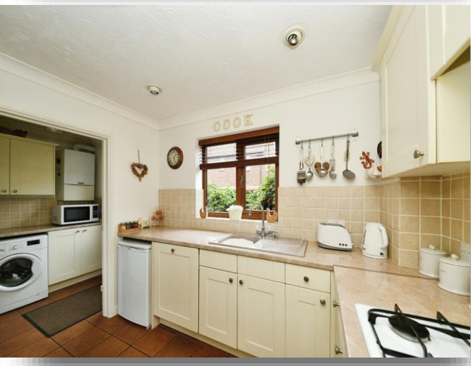
Canon Pott Close, Heacham, King's Lynn, PE31 7RS