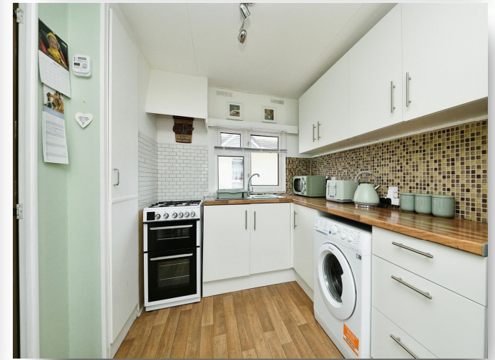
Orchard Park Homes, Station Road, Heacham, King's Lynn, PE31 7HF