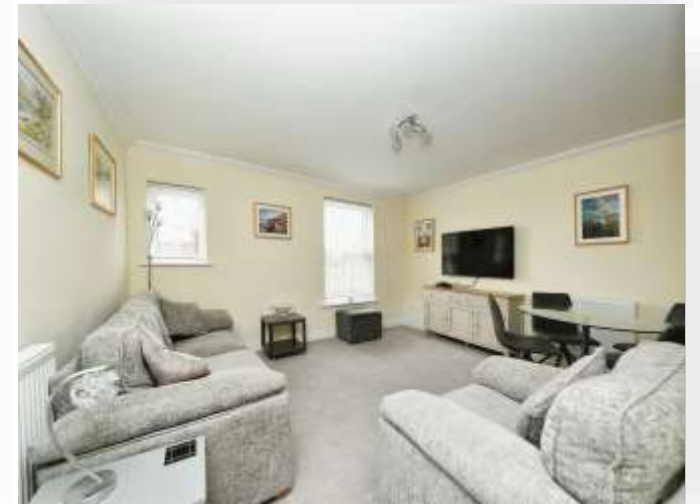
Curlew Close, Hunstanton, PE36 5PT