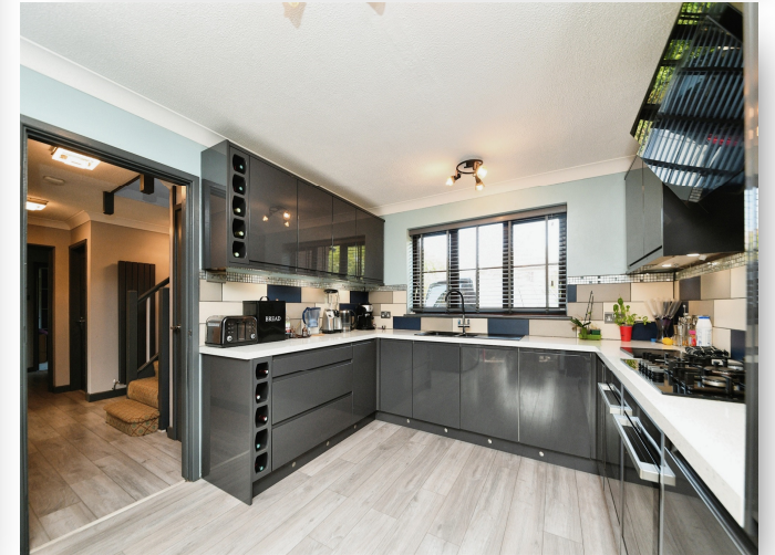
Victoria Close, Heacham, King's Lynn, PE31 7JR