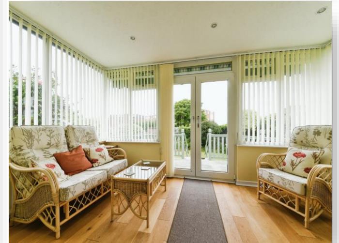
Northgate, Hunstanton, PE36 6DS