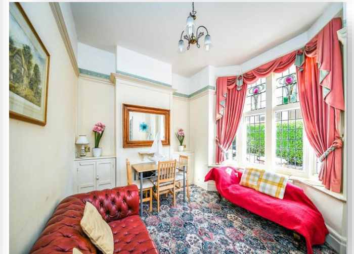
Austin Street, HUNSTANTON, PE36 6AW