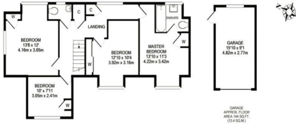
1ST FLOOR APPROX. FLOOR AREA 661 SQ.FT. (61.4 SQ.M.)