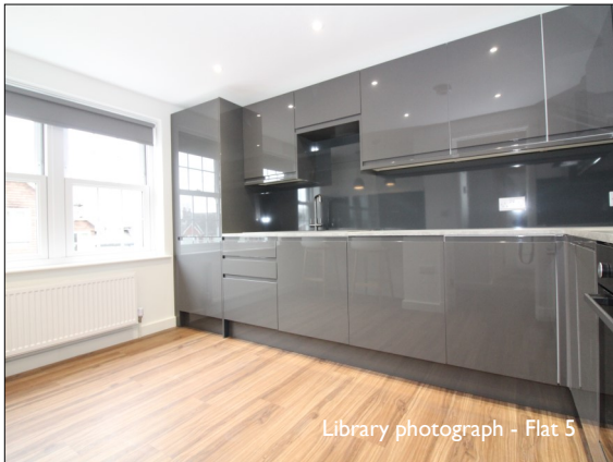
Library photograph - Flat 5