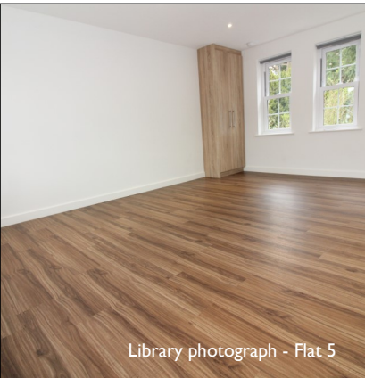
Library photograph - Flat 5