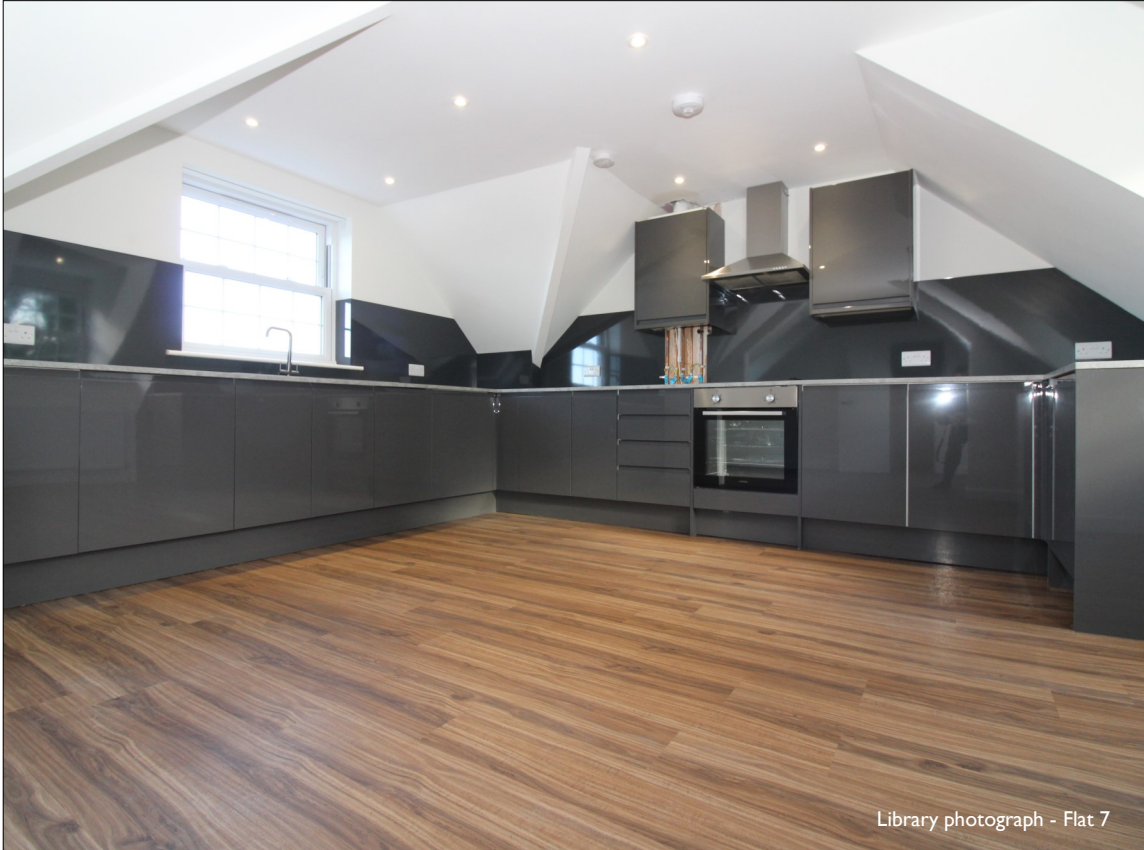
Library photograph - Flat 7