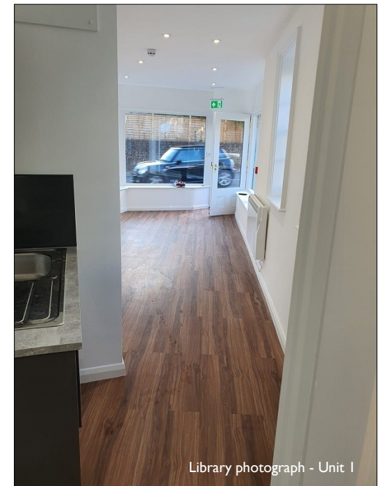
Library photograph - Unit 1