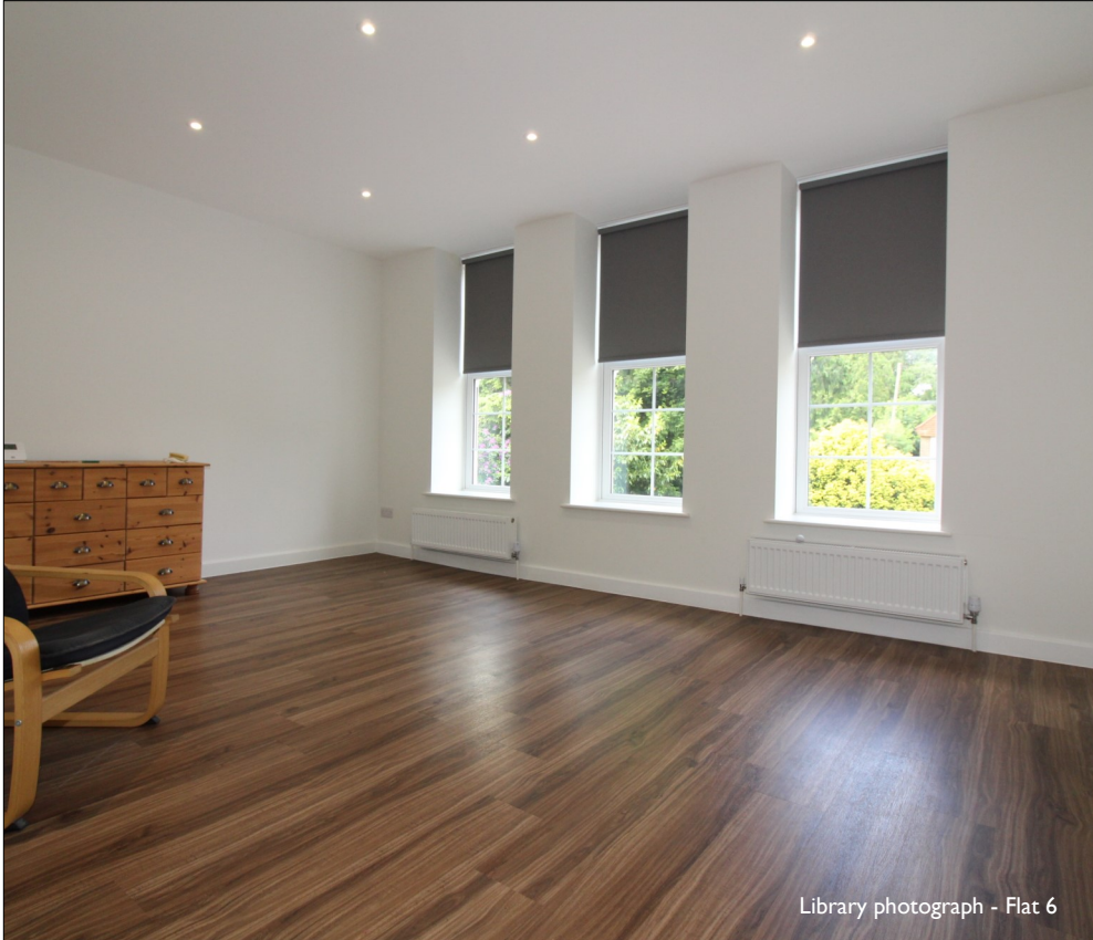
Library photograph - Flat 6