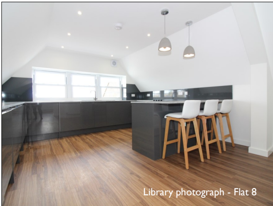
Library photograph - Flat 8