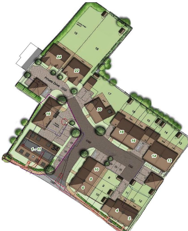
Plot 8, 10 Oast Gardens Approx Internal Area 778 sq ft (72.3 sq m)

Important Notice: Bracketts, their clients and any joint agents give notice that they have no authority to make or give any representations or warranties in relation to the property. These particulars do not form part of any offer or contract and must not be relied upon as statements or representations of fact. The text, photographs and plans are for guidance only and are not necessarily comprehensive. All areas, measurements or distances are approximate and no responsibility is taken for any error, omission or mis-statement. It should not be assumed that the property has necessary planning, building regulation or other consents and Bracketts have not tested any services, appliances, equipment or facilities. Purchasers must satisfy themselves by inspection or otherwise. Prices, rents or any other charges are exclusive of VAT unless stated to the contrary.