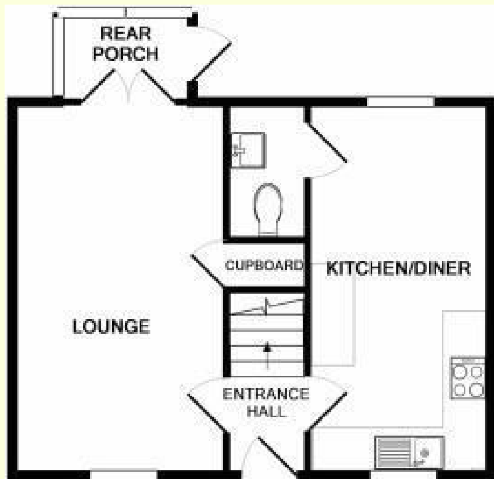
GROUND FLOOR APPROX. FLOOR AREA 405 SQ.FT. (37.6 SQ.M.)